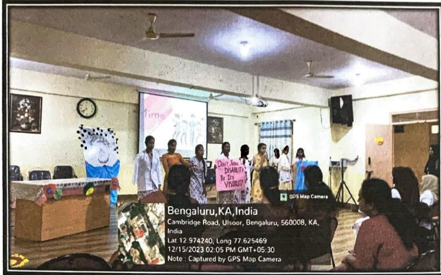
Bengaluru, KA, India Cambridge Road, Ulsoor, Bengaluru, 560008, KA, India Lat 12.974240, Long 77.625469 12/15/2023 02:05 PM GMT+05:30 Note: Captured by GPS Map Camera